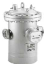
High-pressure positive displacement gas meter