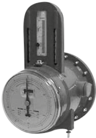
Test gas meter wet version (PVC)

Wet version (drum-type gas meter), max. operating pressure 50 mbar, manometer up to 10 mbar (standard) Version: PVC