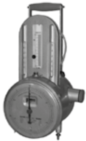
Test gas meter wet version (V2A)

Wet version (drum-type gas meter), max. operating pressure 50 mbar, manometer up to 10 mbar (standard) Version: V2A