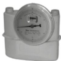
Test gas meter dry version

Dry version (positive displacement gas meter), max. operating pressure 500 mbar – two nozzles, measuring volume 2.0 l standard version, MOZ30/TPT or E51 (NAMUR) pulse generator.