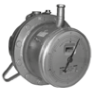
Drum-type gas meter high-pressure version

Wet version (drum-type gas meter), for operating pressures up to PN 10, steel or V2A housing, V2A drum